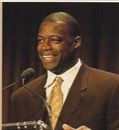
Former Redskin Darrell Green delivered the invocation. He also talked about bringing baseball to DC and about being cut from a baseball team when he was a kid in Texas.