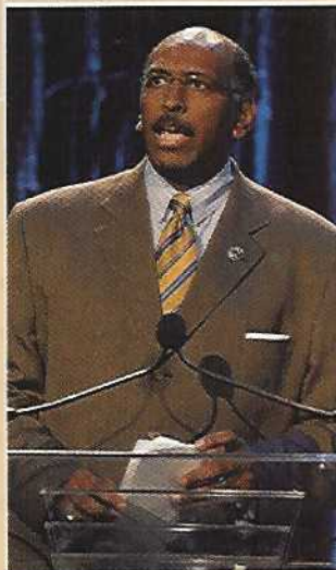
Maryland lieutenant governor Michael Steele praised the business community's support for Junior Achievement.