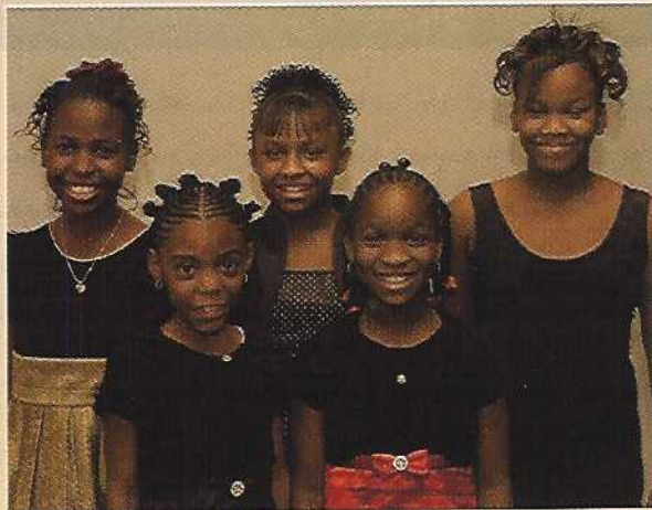
Junior Achievement students from P.R. Harris Educational Center in Washington.