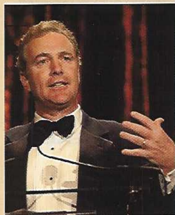
Maryland congressman Chris Van Hollen saluted the Youth Entrepreneur of the Year.